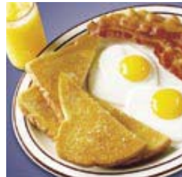
2 Two eggs* any style, juice, toast & jelly. With ham, bacon or sausage 4.95