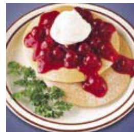
7 Two large fluffy pancakes topped with fruit & whipped topping 3.20