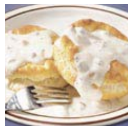
BISCUITS & GRAVY 3.90 (available until 11am)