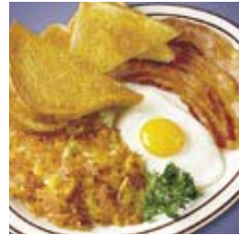
3 One egg* any style, hash browns, toast & jelly. With ham, bacon or sausage 4.90