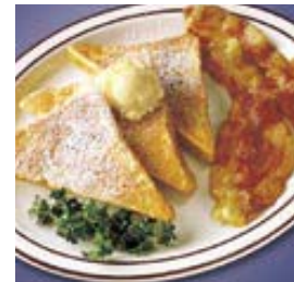
8 French Toast & syrup. With ham, bacon or sausage 4.55