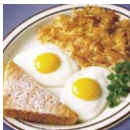
9 Two eggs* any style, French toast & syrup with hash browns 4.35