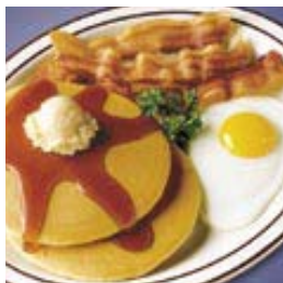
5 Pancake sandwich – Two pancakes, syrup & one egg*. With ham, bacon or sausage 4.50