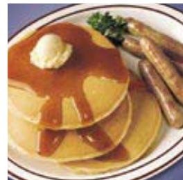
6 Three pancakes & syrup. With ham, bacon or sausage 4.65