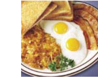
1 Two eggs* any style, hash browns, toast & jelly. With ham, bacon or sausage 5.40